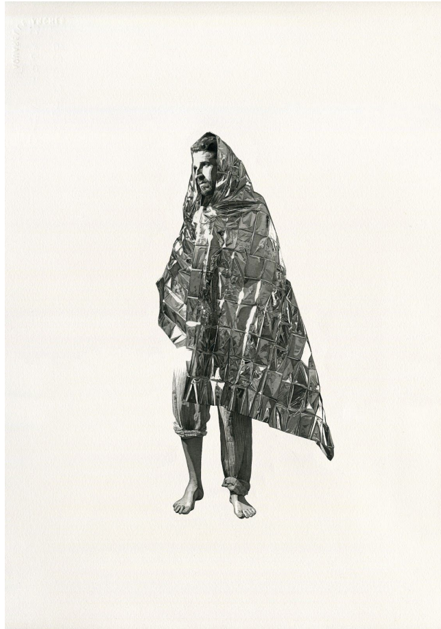
Sous un manteau de novembre, 2017