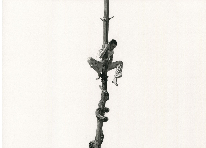
Serpent, 2017 Ink and watercolor on paper 30 x 42 cm

In Serpent 2017 , a nightmare dream, the artist represents himself as 'escaping' from a snake that ascends towards him on a tree. The formal simplicity accentuates the drama where Mérelle expresses a psychological battle within the subconscious. These extreme situations drawn on paper, reflect the vital concerns and fears of Mérelle, an artist attentive to express how a "body language " so that it may be felt by the viewer.