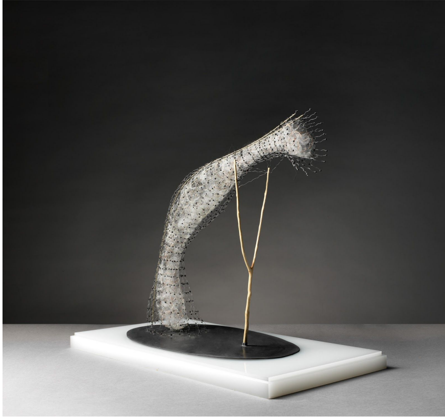
'Aerófilo I' 2019 Wire, wood, lead, vegetable materials and wool 55 x 29 x 50 cm