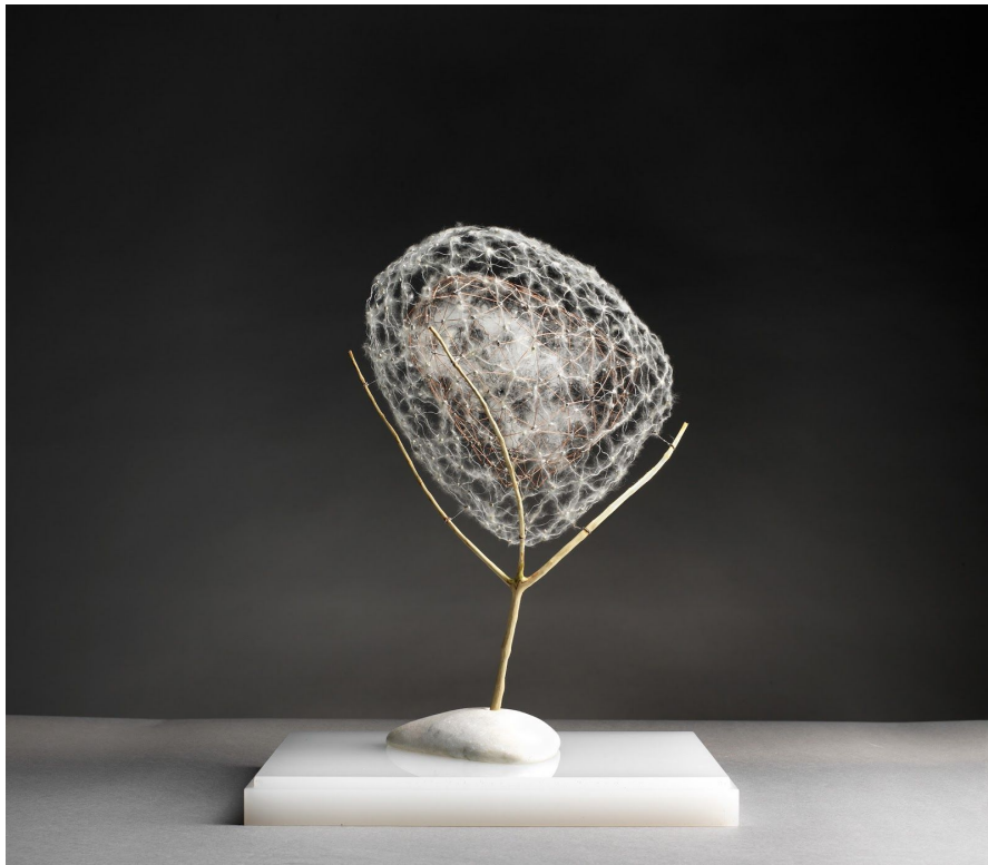
'Aerium' 2019 Wood, wire, marble and vegetable materials 50 x 30 x 34 cm

Also, he indicates that this conflict with geometry persists throughout his work and it is resolved with the inclusion of new forms and new materials in a 'profound circular thought', maintaining the poetic and intimate spirit of his work.