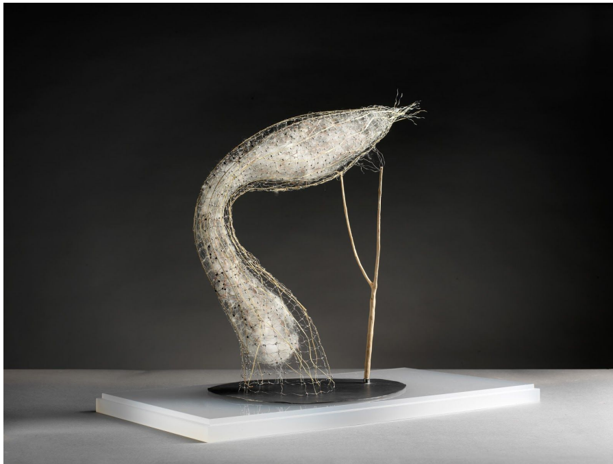
'Aerófilo II' 2019 Wire, wood, lead, vegetable materials and wool 55 x 29 x 50 cm