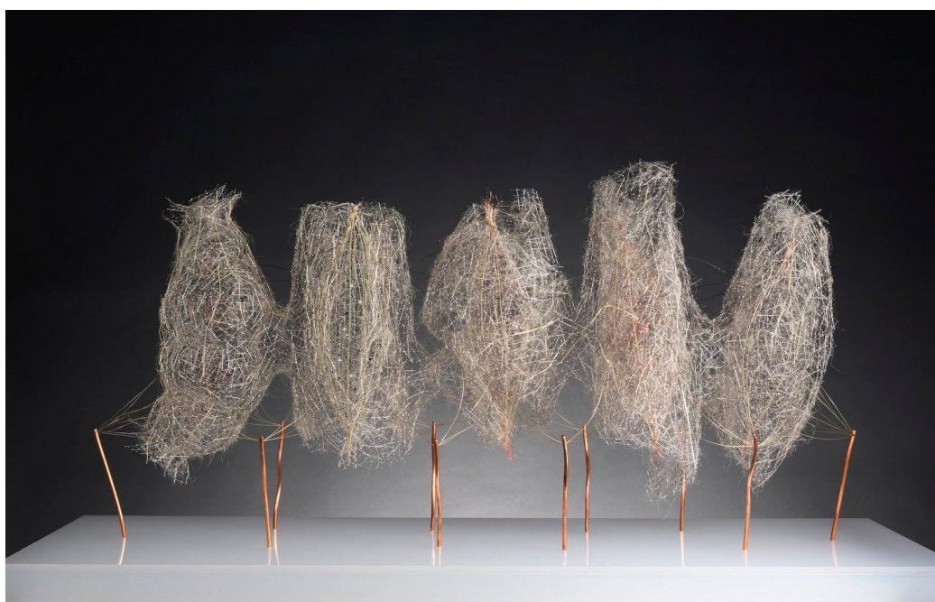
'Pentámero' 2018, Pins, vegetable wires y methacrylate wire 70 x 138 x 60 cm

On the occasion of the opening of the season at Opening 2019 , we have the great pleasure of presenting the individual ' Recent Work ' by Antonio Crespo Foix (Valdepeñas 1953). The exhibition brings together his latest works in which he delves into the formal and conceptual language that characterizes his work.